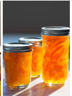
Making marmalade, Grandma's way