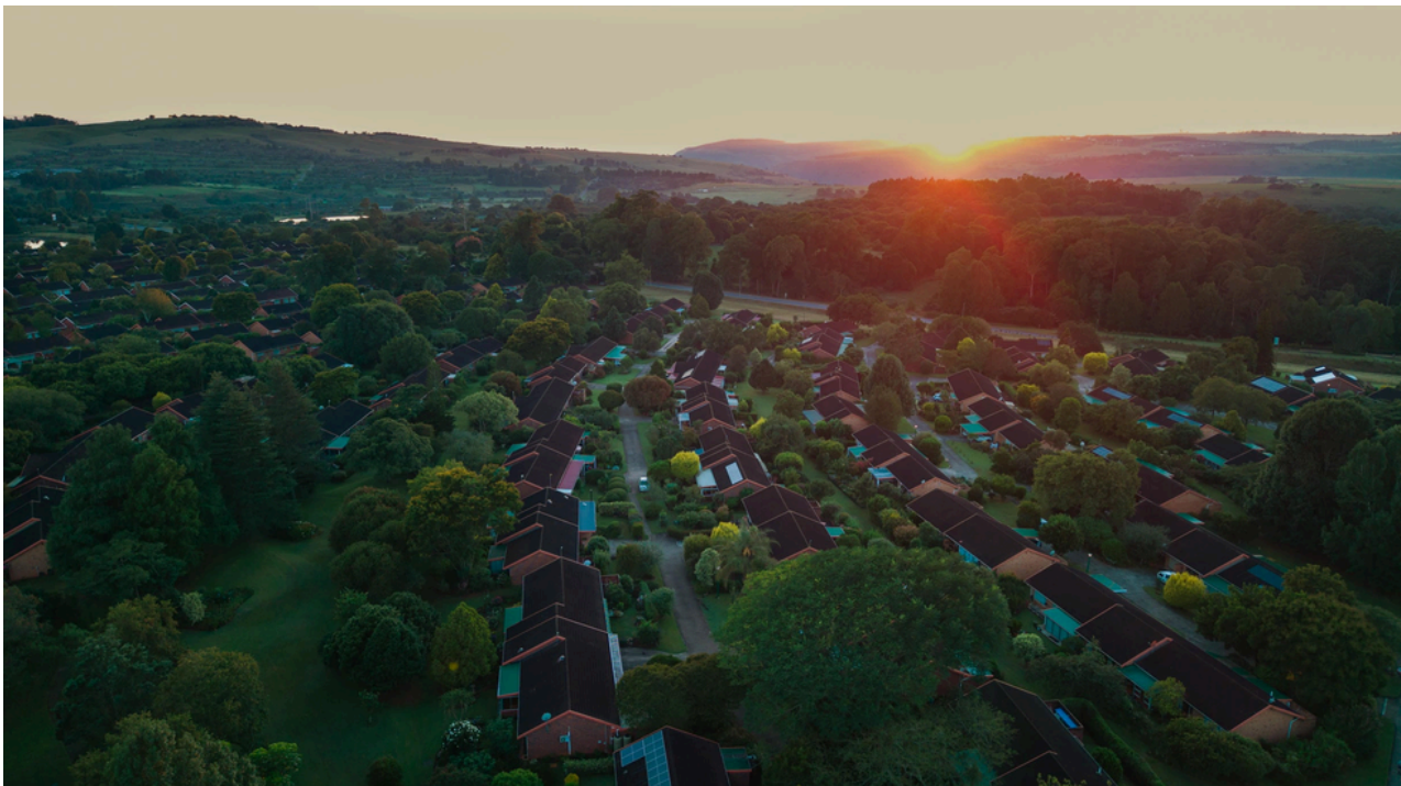
A beautiful autumn sunrise at Amberfield

May your days be filled with happiness, peace, good health, and the love of those who cherish you.