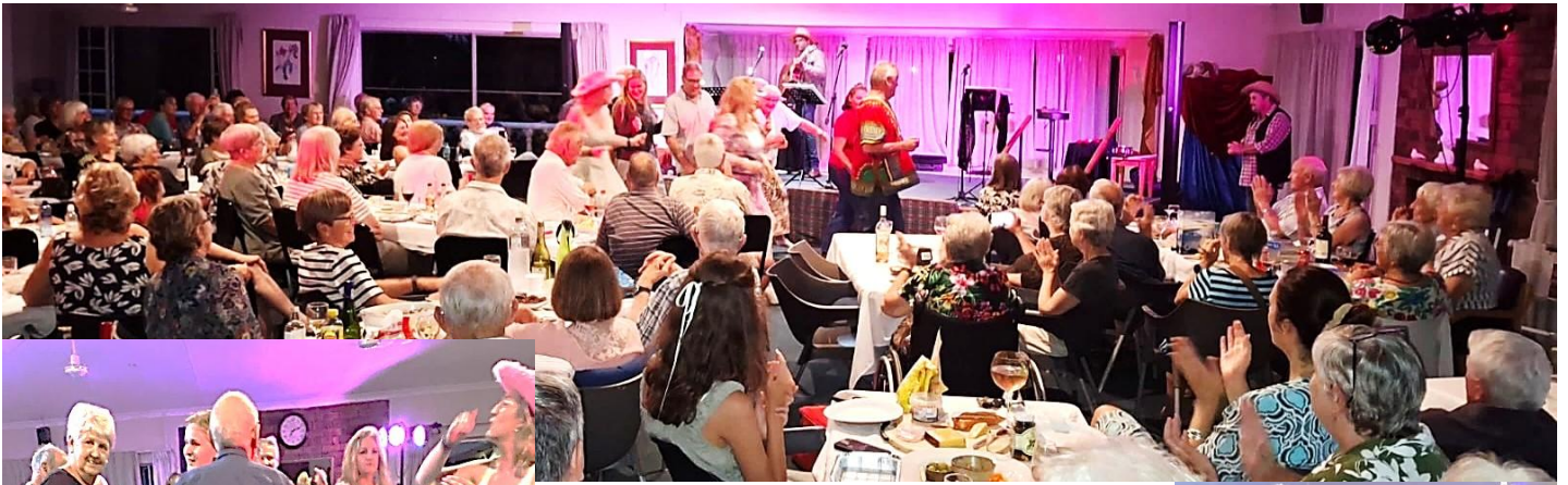
▲ The Dolly Parton & Kenny Rodgers show brought some foot-tapping numbers and a little bit of fun.▶ Then the Floral Art demo inspired a Valentine theme▼